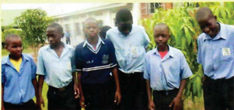
Fig 9: Pupils of Soroti who were supported to plant fruit trees

Eighteen farmer groups with an average membership of 25 received training on use of renewable energy with special emphasis on the use of energy saving stoves. The aim is to reduce the frequency of firewood collection