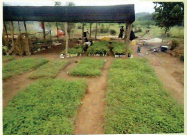
Fig 16: A Shadoof well from which farmers collect water for their nursery bed