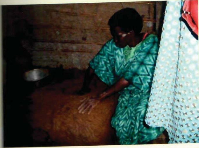
Fig 10: A farmer making an energy saving stove in her kitchen.

Farmers were also encouraged to start using simple solar energy equipment. A direct partnership was established between AFIRD and Bare Foot Products; an international solar energy service provider working in Uganda. Under this partnership, Farmer with products supplied by Bare Foot products agents that needed repair(s) were attended to through solar equipment energy clinics.