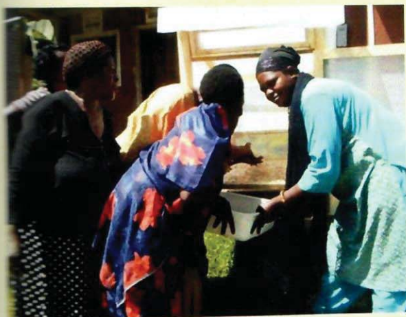
Fig 14: Farmers of Nkowe group collecting dried mushrooms from the solar drier.