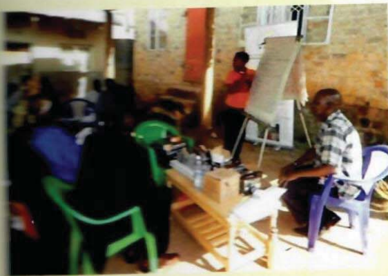
Fig 11: A Barefoot agent taking farmers through one of the solar energy equipment clinic

In addition, five groups each with a total membership of 132 farmers were sensitized on solar energy use and 25 solar lamps were supplied to the farmers at reduced rates. The use of solar equipment by farmers has created convenience and contributed to reducing pollution inside homesteads.