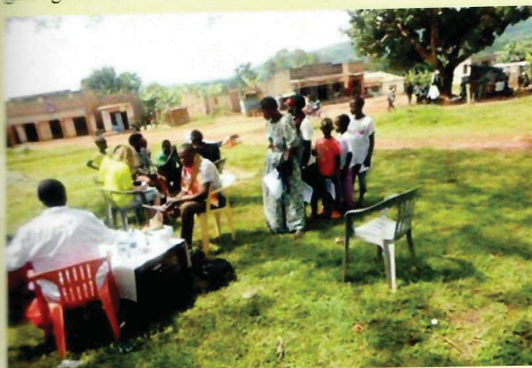
Fig 17: HIV/AIDS Voluntary Counseling and testing at Mende

In conjunction with Kiyita Family Alliance for Development (KIFAD), HIV testing and counseling services have been extended to farmers in their localities. Farmers started demanding for HIV testing and counseling services. Five HIV/AIDS workshops were conducted, from which 355 people have been able to know their HIV status. The victims have been counseled and linked to HIV/AIDS service provider from which they are getting ARVs.