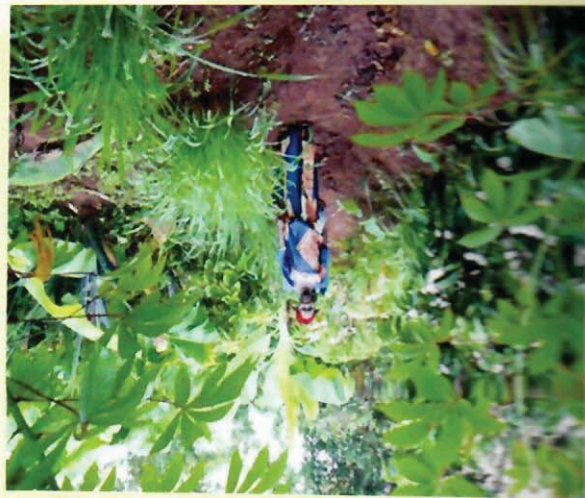
Fig 5: A farmer standing beside a soil and water conservation structure on her rejuvenated farmland

The interface between the farmers and extension staff enabled farmers to get professional advice on unique challenges constraining their farm production.