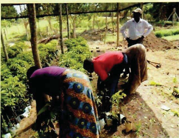
Fig 8: Bbanda farmers working in their Nursery bed

Three schools and four CBOs were supported to plant 700 grafted fruit trees for nutrition and environmental conservation. These beneficiaries are in both Central and Eastern Uganda.