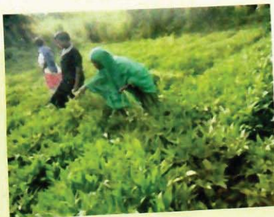
a. Fig 3a: Farmers collecting potato vine from a multiplication garden, 3b: farmer planting potato vines, 3c: farmers displaying harvested orange fleshed sweet potato rich in Vitamin A.