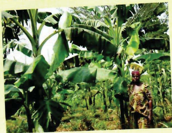
Fig 4. Farmer working in her improved banana plantation from which other farmers have been able to get suckers

AFIRD also sensitized farmers on the importance of fruits in nutrition and income improvement. In addition to this; 3,365 grafted mangoes 2,030 Pawpaw were given to farmers to carry out commercial fruit production.