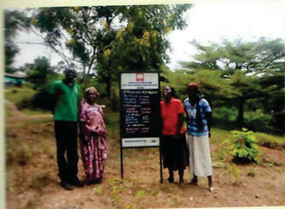
Fig 15: Farmers of Magezi Muliro group at their market information board.

Nineteen information boards were set up at farmer group level within the farming communities. These boards have bridged the information gap between farmers and the market. Through partnership with PELUM and FAMGAIN, information on a number of crops in major markets of Kampala was disseminated. This has enabled the farmers to make informed decisions on prices for their produce. In addition, community events have also been publicized.