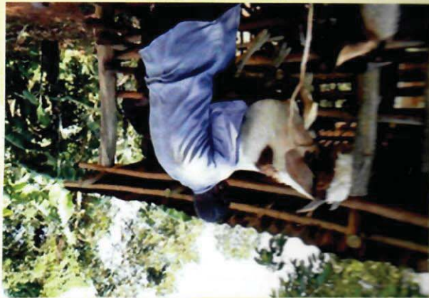
Fig 6: One of the farmers who received breeding Boer goats from AFIRD feeding them

Eighteen pairs of elite breeding Boer goats were given to 18 Households in Mende Sub County to start upgrading their local animals. The aim for introducing animals of high genetic potential is increased productivity and income from goats.